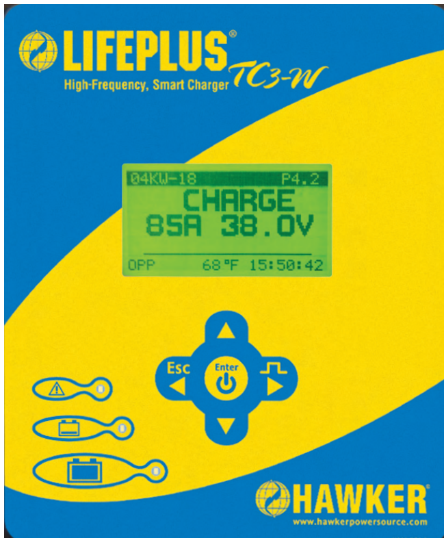
The LIFEPLUS® TC3-W control panel allows for simple, yet powerful programmability that can be done onsite.